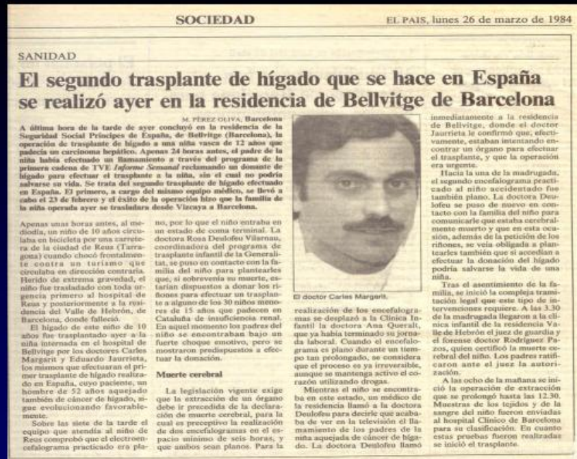
1984. Media coverage of the second liver transplant in Spain.