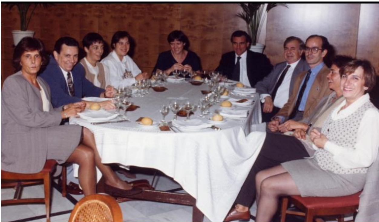
1992. Celebrating the hundredth liver transplant in Hospital of Vall d' Hebron.